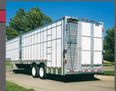
Protection from the Elements is Provided with the Addition of a Winter Kit Made of Lightweight Corrugated Panels as an Extra Cost Option.

Notice: All visual representations, dimensions, and specifications contained in this literature are based on the latest product information available at time of publication approval. The right is reserved to make changes in materials, equipment, design, specifications, and models, and to discontinue models.