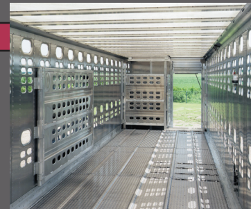
Inside View from Front to Rear. Smooth Interior Walls and Full Wrap-Around Hinge Collars Protect Against Livestock Bruising. Kemlite Roof for Visibility.