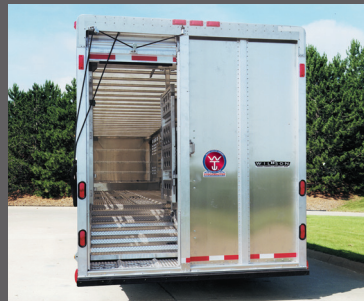
Left-hand Rear Roll-up Door (standard) and Reduced Step Ramp with Fold-to-Corner Bull Bar.

FINISH: All Steel components are primed and painted with a gray synthetic enamel finish coat to retard rust. King Pin area is painted and undercoated to fight corrosion. All aluminum components are left natural.