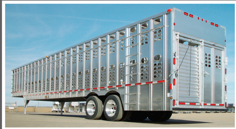
Model: PSAGL: Punch Side Aluminum Ground-Load Livestock

The StockMaster Punch Side Aluminum Ground-Load Livestock Trailer has a lowered rear threshold providing the convenience of loading and unloading almost anywhere without adjustable chutes. The riveted aluminum construction consistently delivers durability and value that has been time-tested by loyal Wilson customers for over a century. With StockMaster's smooth inside skin, superior ventilation, and minimum step-up, these same Wilson customers have confidence their valuable cargo will be delivered safely, securely, and successfully with minimal stress and strain.