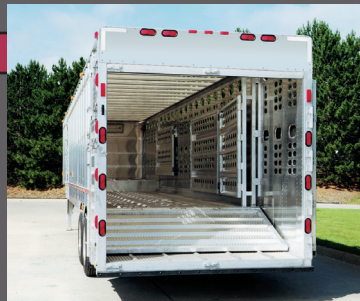
Full Swing Door with Full Width Ramp for Straight-Through Loading and Unloading.